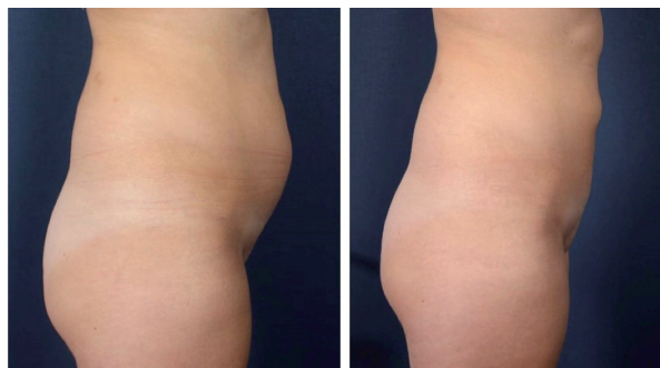
Fig. 2a + b: Cryolipolysis™ of the abdominal region, in combination with radio frequency (VelaShape™) and the ZWave Pro before treatment (a) and after 4 weeks (b)

Cryolipolyse™ in the abdominal region, in combination with radio frequency (VelaShape™) and the ZWave Pro .