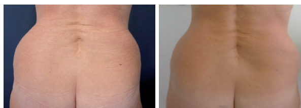
Fig. 3a + b: Combined cellulite treatment of hip and buttock region with radio frequency (VelaShape™) and the ZWave Pro before treatment (10 times in 10 weeks)

Combined cellulite treatment on the hip and buttock region with radio frequency (VelaShape™) and the ZWave Pro