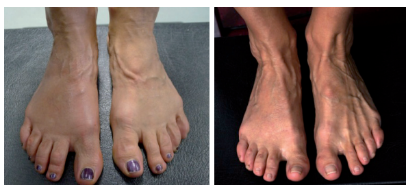
Fig. 4a + b: Secondary lymphedema of the right forefoot after variceal surgery before and after 10 treatments (1-2 times a week)

Secondary lymphedema after varicose vein surgery, and also temporary local lymphatic induration after miniphlebectomy, responded well to ZWave Pro treatment.